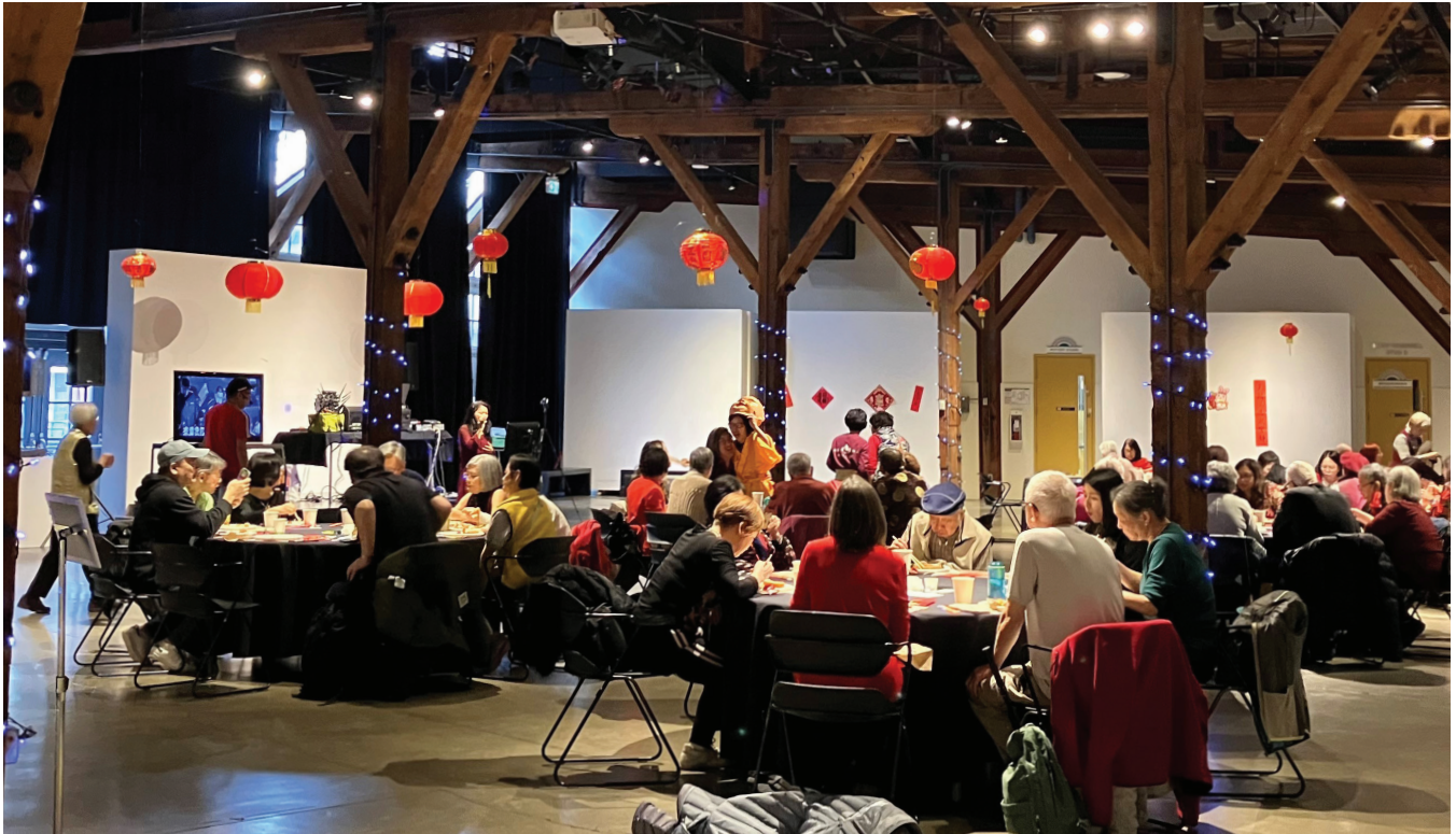
Lunar New Year celebration