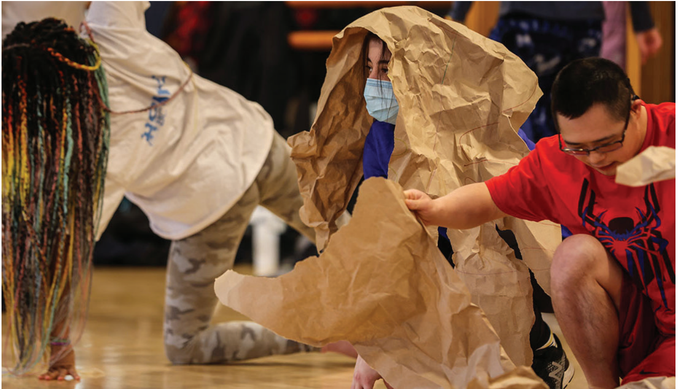
Ready Dance at BC Youth Week